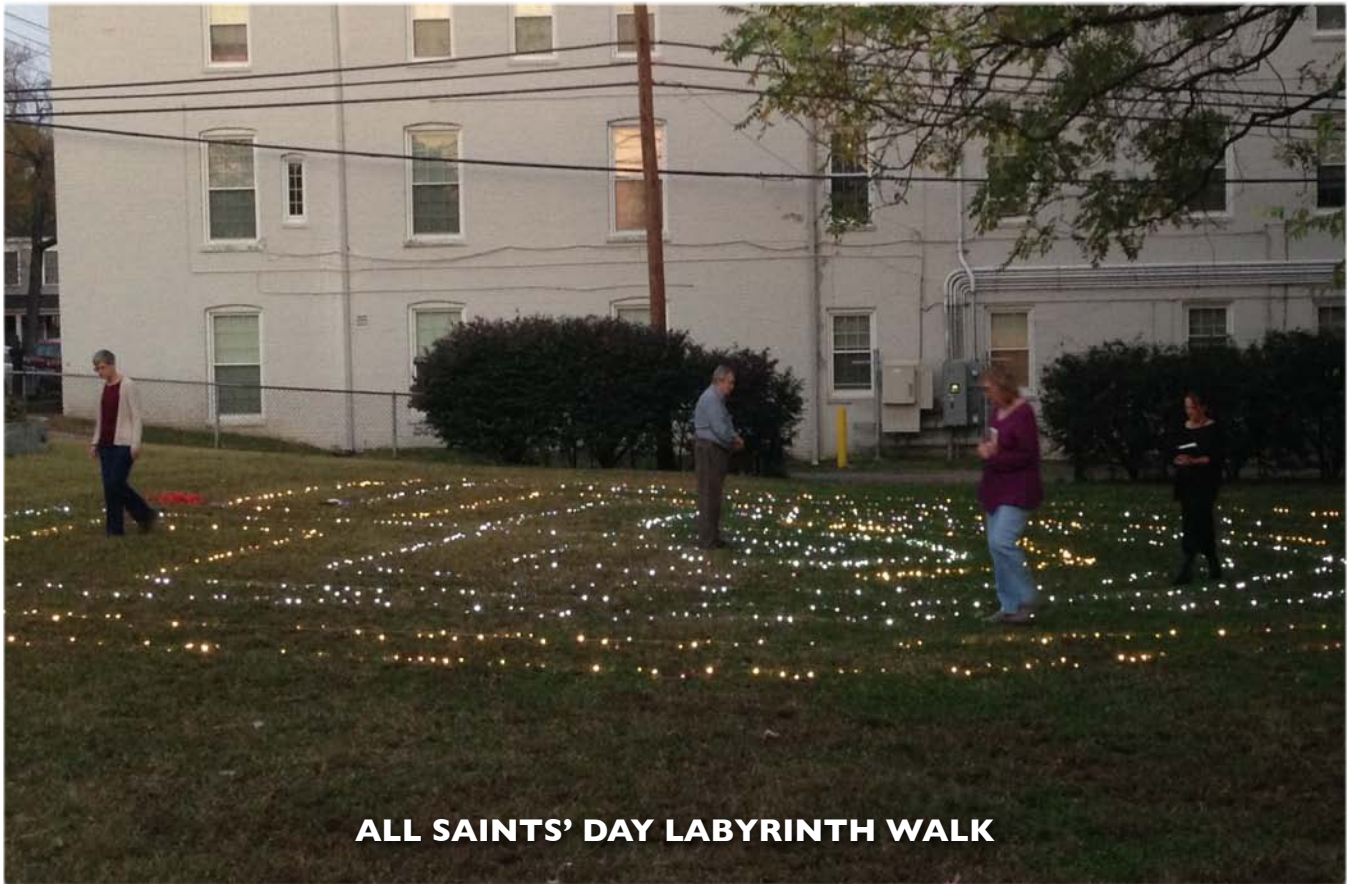
ALL SAINTS' DAY LABYRINTH WALK