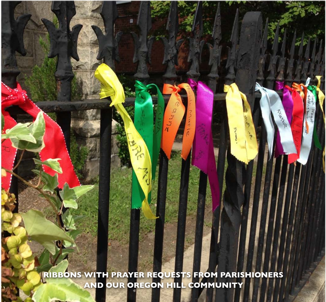
RIBBONS WITH PRAYER REQUESTS FROM PARISHIONERS AND OUR OREGON HILL COMMUNITY