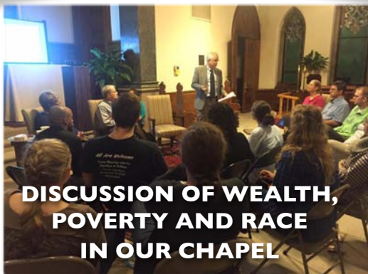
DISCUSSION OF WEALTH, POVERTY AND RACE IN OUR CHAPEL