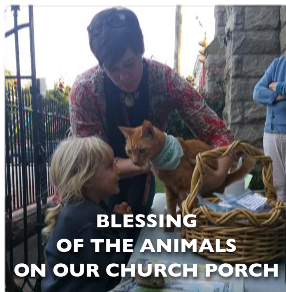
BLESSING OF THE ANIMALS ON OUR CHURCH PORCH