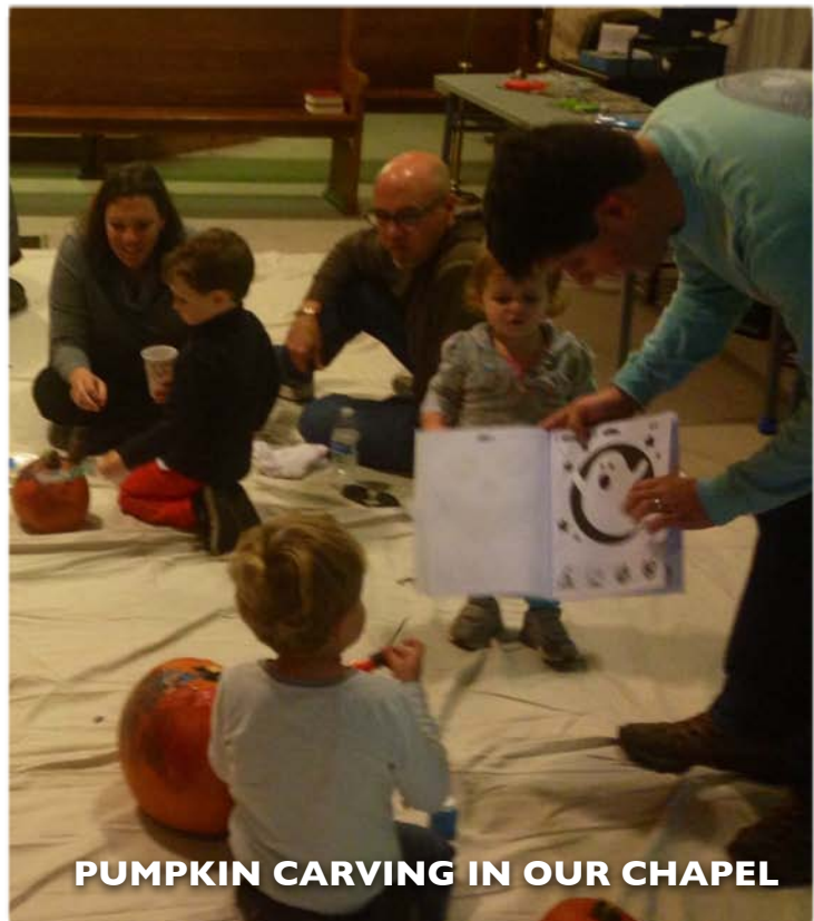
PUMPKIN CARVING IN OUR CHAPEL