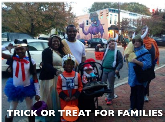
TRICK OR TREAT FOR FAMILIES